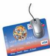
paying bills online?